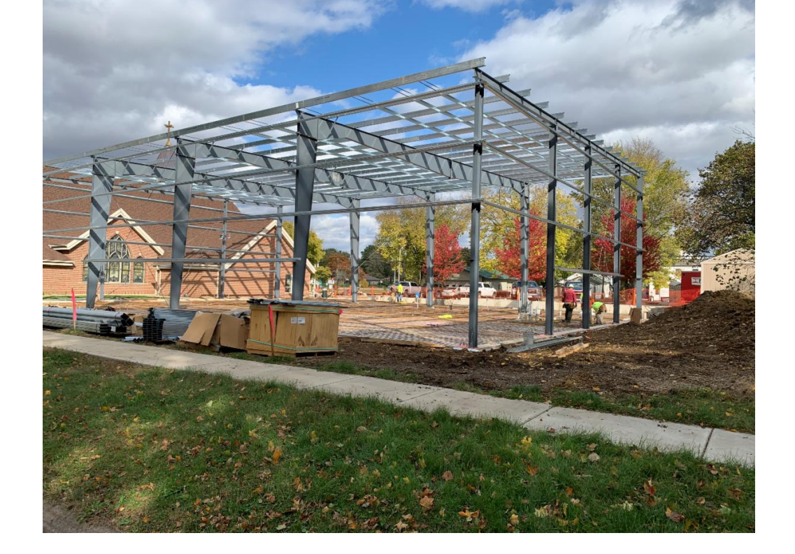
Future Family Life Center at Tremont United Methodist Church

Please send us your news stories and they will be included in upcoming emails. Deadline to include information is Friday, 6:00PM for the following Monday.